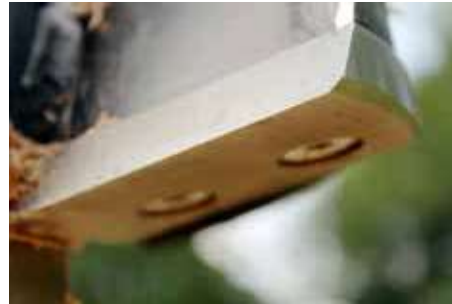
Hardened Steel blades

Quick and easy with minimal mess compared to traditional stump grinding makes this a must-have product for those working in ground preparation and woodland maintenance.