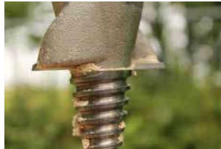
Hardened Steel pilot